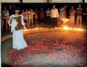
Nestinar – ancient fire ritual