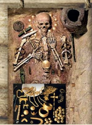
The oldest gold treasure in Europe