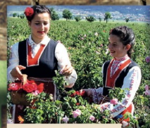
Bulgarian rose pickers

We gladly invite you to join us for special edition of Terra Incognita, tour of Bulgaria. It's will be held in two parts, before and after 5th Bulgarian treffen 10/13-17/20.09.2017. We will start in Alexandroupolis, after Greece treffen and will finish in Canakkale, before Turkey treffen. You can participate in the first, second or both part. During the first part we are going to plunge into a country of hoodoo and ancient legends. We will visit one of the most famous Bulgarian monasteries, museums and archaeological sites, antique Thracian temples and tombs, will ride around lands where Orpheus lived and played his music. The second part we will ride in the land of Second Bulgarian Kingdom. We will visit Veliko Turnovo, the ancient capital of Bulgaria, ethnographic v. Etara, monument 1300 years Bulgaria, Madara Horseman, Shipka, we will ride to the Valley of the Thracian Kings and much more from a different kind of Bulgaria. We will close the days, relaxing in best hotels with delicious Bulgarian cuisine and the best wines from the region. To enjoy the best, we are offering an All Inclusive trip. Participation fee covers 3+3 nights in 4* hotels, breakfast, lunch, dinner, coffee breaks, museum, galleries, a unique T-shirt, certificate and personal gift. Each day Terra Incognita will end in a different town with a special dinner of local food and drinks.