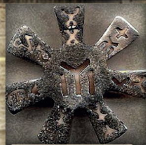
Medieval bulgarian sign