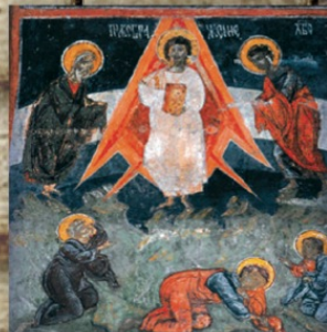
Fresco of Jesus Christ in a rocket, 16 c.