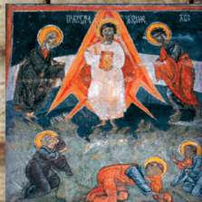
Fresco of Jesus Christ in a rocket, 16 c.