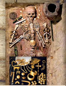
The oldest gold treasure in Europe