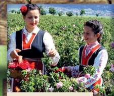
Bulgarian rose pickers

Come join our second Terra Incognita 2013 tour of Bulgaria. This year we will delve into Bulgaria's land of Magic and Ancient Legends . We will visit Temples and Thracian tombs, and ride our bikes where Orpheus lived and played. We'll also see how deep the "Devil's Throat" really is. We will bow before the recently discovered and authentic relics of St. John the Baptist, as well as visiting many other mythological places. Along with these ancient and wild revelations, we will end our days relaxing in luxury hotels, and enjoy delicious traditional food with the best wines of the region. Everything will be topped with traditional folklore, and genial company. For your enjoyment, we offer an 'All inclusive' trip. The participation fee includes 6 nights in 4* or 5* hotels, breakfast, lunch, official dinners, visits to museums and national parks, unique t-shirts, badges and certificates. Every day of Terra Incognita 2013 will find you in a different city, with a themed event and evening dinner. In addition, traditional music and artistic entertainment will be on offer. Please book early as there are a limited number of places available. This year we have a maximum of 50 wings. "Terra Incognita" begins where it ended last year in Sofia. This 2013 tour begins with a welcome on Sunday evening 28 th July. The 'rides out' will start the next day. The Tour will finish on 03 August in Pomorie with a gala dinner. For complete information and registration please visit www.gwcbg.org