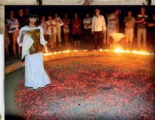
Nestinar – ancient fire ritual