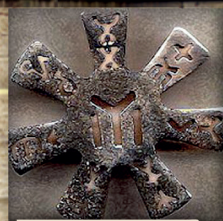
Medieval Bulgarian sign

Come join our second Terra Incognita 2013 tour of Bulgaria. This year we will delve into Bulgaria's land of Magic and Ancient Legends . We will visit Temples and Thracian tombs, and ride our bikes where Orpheus lived and played. We'll also see how deep the "Devil's Throat" really is. We will bow before the recently discovered and authentic relics of St. John the Baptist, as well as visiting many other mythological places. Along with these ancient and wild revelations, we will end our days relaxing in luxury hotels, and enjoy delicious traditional food with the best wines of the region. Everything will be topped with traditional folklore, and genial company. For your enjoyment, we offer an 'All inclusive' trip. The participation fee includes 6 nights in 4* or 5* hotels, breakfast, lunch, official dinners, visits to museums and national parks, unique t-shirts, badges and certificates. Every day of Terra Incognita 2013 will find you in a different city, with a themed event and evening dinner. In addition, traditional music and artistic entertainment will be on offer. Please book early as there are a limited number of places available. This year we have a maximum of 50 wings. "Terra Incognita" begins where it ended last year in Sofia. This 2013 tour begins with a welcome on Sunday evening 28 th July. The 'rides out' will start the next day. The Tour will finish on 03 August in Pomorie with a gala dinner. For complete information and registration please visit www.gwcbg.org